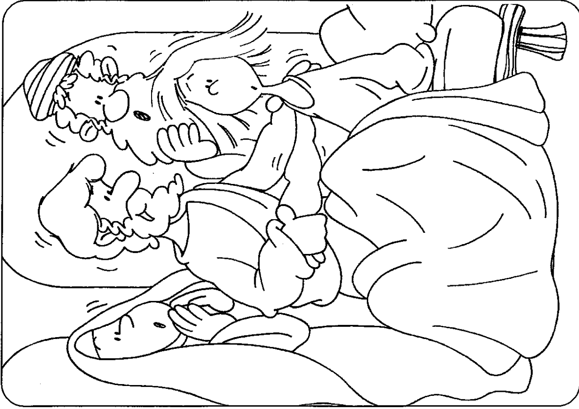
Taking her by the hand He said to her, "Talitha cumi," which means, "Little girl, I say to you, arise." Mark 5:41