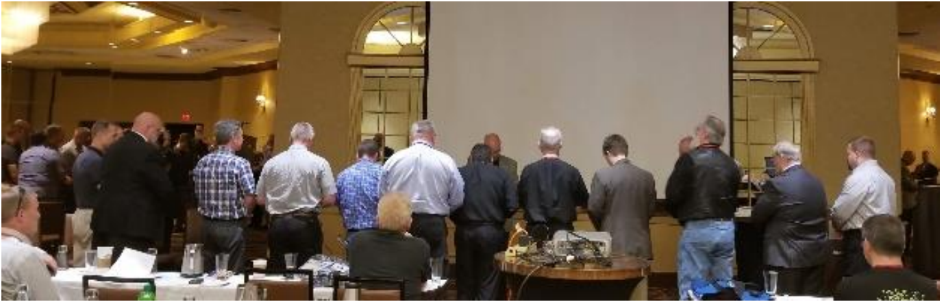
Photo below is the installation of New England District officers, directors and circuit visitors following the conclusion of the 18 th regular convention on June 16, 2018.